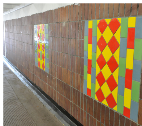
Dark and dreary before the WallSpace installation